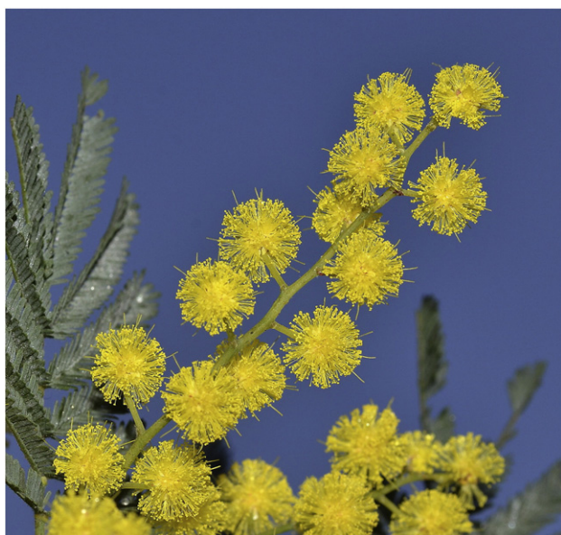
Fig. 1. Flowering branch of Acacia dealbata . Flower heads are \pm 5 mm in diameter and consist of 22–42 individual flowers. Styles can be seen protruding beyond the anthers.

In KwaZulu-Natal, A. dealbata mass-flowers in early spring (July to September). It bears racemes of compact yellow globose flower-heads (inflorescences) containing 22–42 minute protogynous flowers (Broadhurst and Young, 2006) (Fig. 1). These inflorescences are highly integrated units that act as blooms and produce only one or a few fruits each (Kenrick and Knox, 1989a; Gibson et al., 2011). In Australia A. dealbata is mainly diploid, with occasional tetraploids and triploids reported (Blakesley et al., 2002). Allozyme analysis indicates that this species is highly outcrossing in its native range ( t_m = 0.89 – 1.00 , n = 6 populations), where it is probably pollinated by introduced honeybees and native bees (Bernhardt,