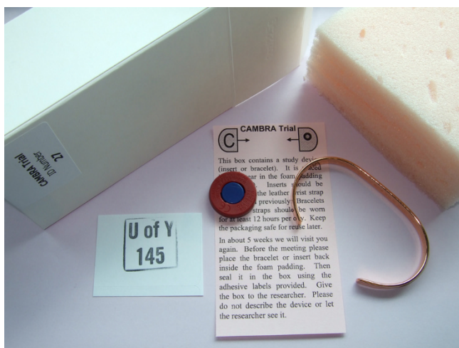
Figure 3 Study devices and packaging. Photograph of MagnaMax® insert, copper bracelet, and materials used in packaging devices.

Of the 70 people recruited into the study one participant has died due to an unrelated medical condition and three others have withdrawn from the trial entirely. From the remainder, 56 people have finished all aspects of the trial and 10 others are currently completing the final treatment phases of the study. Excluding the four people mentioned initially, all participants have been successfully followed up after each treatment phase, providing complete questionnaire data to date. The exceptionally high completion rate for questionnaires observed so far is almost certainly attributable to the use of home visits as the main follow up method, which has helped to maintain commitment amongst participants and fostered trust with the principal investigator. Participants have also showed great enthusiasm for the study, which has been demonstrated by their overall willingness to have repeated blood samples taken at their general practice.