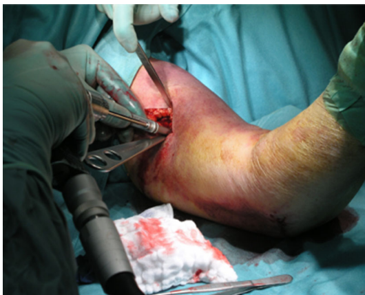
Fig. 2 Humeral bone screws placement