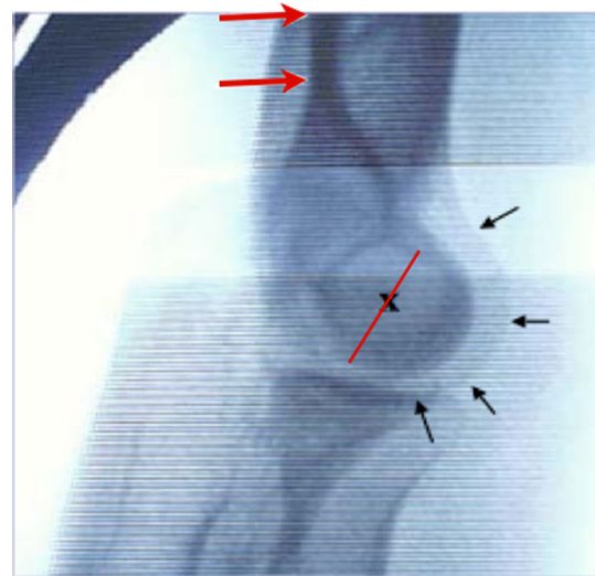
Fig. 4 Image intensifier identification of center of rotation landmarks

mobilization. We argue that indirect stabilization of the coronoid fracture by HEF allows it to heal and consolidate. During elbow valgus stress with a damaged MCL, the radial head becomes the primary stabilizer, and our cases