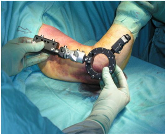
Fig. 1 HEF placement