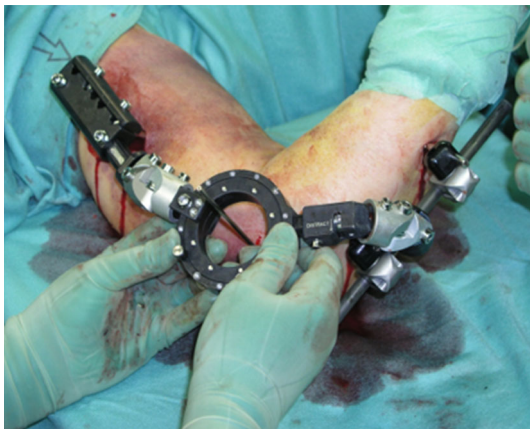
Fig. 3 Elbow's center of rotation identification

mobilization. We argue that indirect stabilization of the coronoid fracture by HEF allows it to heal and consolidate. During elbow valgus stress with a damaged MCL, the radial head becomes the primary stabilizer, and our cases