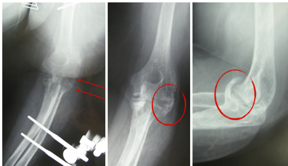
Fig. 6 X-ray demonstrate bone metaplasia formation within the anterior capsule and collateral ligament complex