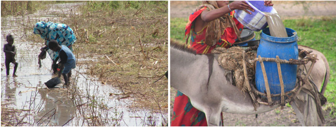
Figure 3. On the left , a mobile pastoralist woman and her children collect surface water for consumption and washing; on the right , collected surface water for consumption and washing is turbid and contaminated with animal and human excreta.