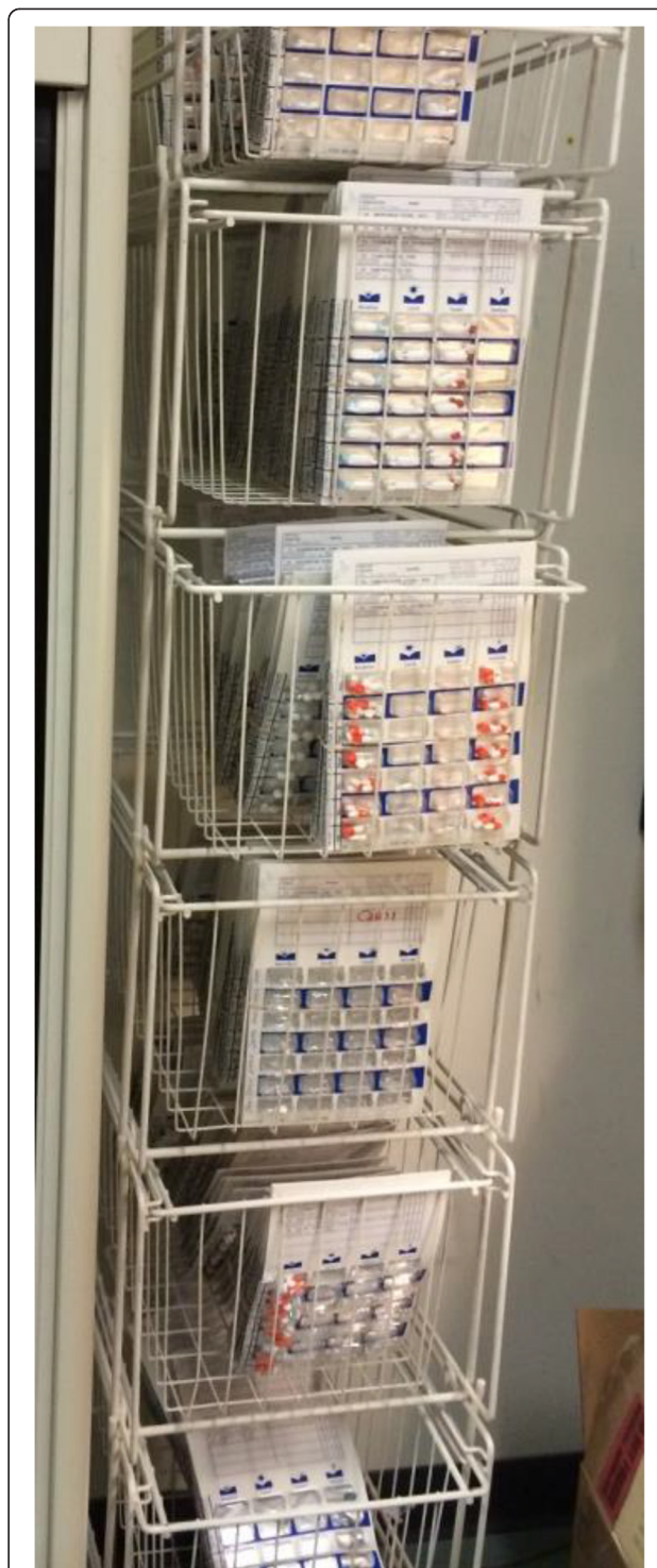
Fig. 1 Racks of convenience packaging (i.e. blister packs) of medications awaiting patient pickup in the Community Health Centre (CHC) dispensary. Storage and organization of these large volumes of medication is a challenge.

II: in the bubble packs...a lot of people who have chronic illness have bubble packs, right? They are