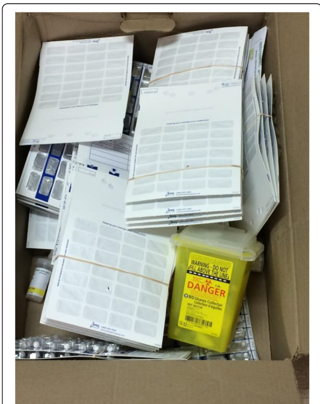
Fig. 3 A box of unclaimed retail pharmacy medications, the majority in convenience packaging (i.e. blister packs), awaiting return to the Regional Health Centre for disposal through incineration. Some informants indicated that medications might be returned in medical sharps containers (seen bottom right) to facilitate disposal.

trying a new medication, or they're bumping up a milligram, they'll be on it for a long time and not understand why when 'the doctor said I should be off it by now and I'm still on it'