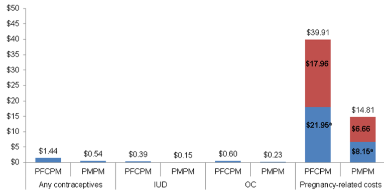
Figure 2 Payments PFCPM and PMPM for all contraceptives, IUD, OC, and pregnancy in 2008. Notes: PFCPM: per female member of childbearing age per month; PMPM: per member per month; OC: oral contraceptive; IUD: intrauterine device a. Unintended pregnancies were estimated at 55% based on an article by Finer and colleagues (Unintended Pregnancy Rates at the State Level, Perspectives on Sexual and Reproductive Health 2011; 43:78-87).

thirds of women covered by Medicaid are of childbearing age [31], the high level of unintended pregnancies [5], and the fact that Medicaid covers around two thirds of these pregnancies [3,4], access to adequate contraceptive coverage fills a key public health care need.