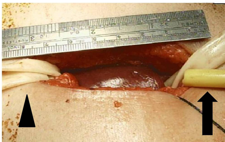
Fig 2 Pringle maneuver with Rumel tourniquet (black arrow) and outflow control with hanging maneuver (black arrowhead)

Because of the above reasons, many surgeons reported alternative operations for liver tumor resection under minimally invasive concept such as hand-assisted laparoscopic hepatectomy or laparoscopic-assisted open hepatectomy. Hand-assisted technique during these laparoscopic procedures can afford several benefits that include the ability to use the surgeon’s hand to help stabilize and mobilize the liver and, in cases of hemorrhage, the use of temporary digital control by the