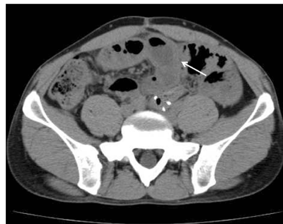
Figure 1 Abdominal computed tomography shows a dilated and filled small intestine enveloped by a thickened membrane (arrow).

Approximately 15 months after surgery, the patient presented to our hospital complaining of nausea, abdominal distention, and abdominal pain. His body weight had decreased from 60 kg at the time of initial surgery to 50 kg. Levels of the tumor markers, carcinoembryonic antigen and carbohydrate antigen 19–9, were within normal range. Abdominal x-ray showed increased intestinal gas and gas-fluid levels. He was admitted to the hospital with a diagnosis of adhesive intestinal obstruction. Abdominal computed tomography (CT) scan showed a dilated small intestine enveloped by a thickened membrane (Figure 1). After admission, we diagnosed as EPS based on these data. He was treated with decompression via long intestinal tube and with intravenous betamethasone administration. After 3 days, intestinal obstruction