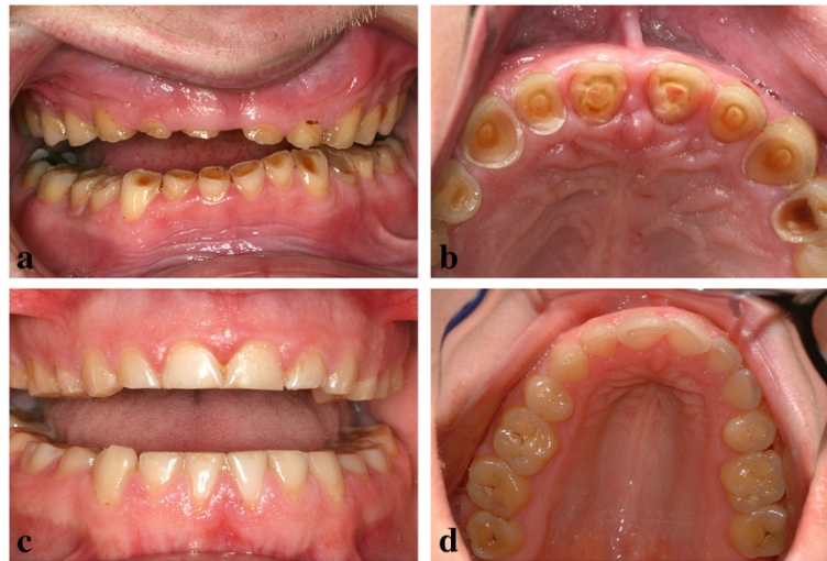
Figure 1 Tooth wear in PWS. (a, b) Extreme tooth wear with pulp exposure in 6 teeth in a 36-year-old male, (c, d) Typical tooth wear in a 28-year-old female.

individuals in the study group ( n = 2 > 18 years, n = 1 < 18 years).