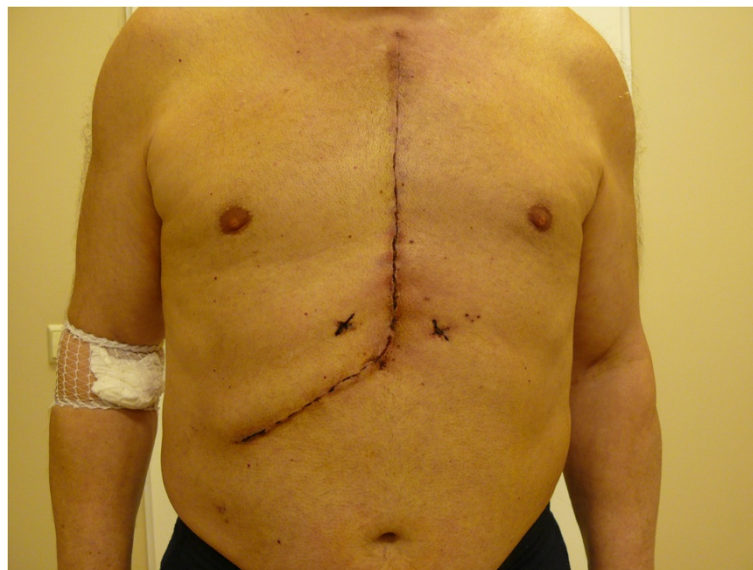
Figure 2 Extended sternotomy. The extended sternotomy incision post-operatively.