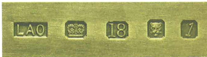
A set of hall-marks on a piece of gold plate. First comes the maker's mark, ordained in 1363 by Edward III, followed by the standard marks for gold, the crown with the 18 carat mark, then the leopard's head, established by Edward I in 1299, and finally the date letter, in this case for 1966. Date letters were introduced just 500 years ago in 1478

The standard for coinage remained at 22 carat, but it was beginning to be realised that in the melting and casting of alloys of gold with copper or silver considerable segregation occurs during solidification. A