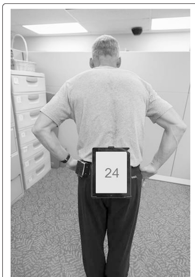
Figure 2 The iPad's gyroscope and accelerometer capture linear and rotational movement to calculate volume of postural sway when belted to the waist of the participant. In this figure, the iPad is counting down from 30 seconds as the participant performs the following stances: 1) double leg stance, firm surface, eyes open; 2) double leg stance, firm surface, eyes closed.

For this study, structural MRI, functional MRI (fMRI), fcMRI and cerebral blood flow (CBF) data will be acquired on four occasions: Baseline (on and off antiparkinsonian medication), EOT, and EOT + 4 weeks. The structural scan is a T1-weighted anatomic image for identifying brain anatomy. The fMRI and fcMRI scans will be acquired with blood oxygen level-dependent (BOLD)-weighted echoplanar imaging scans. Two fcMRI scans will be acquired while subjects rest in the scanner with eyes closed. Two fMRI scans will be acquired in each session while subjects complete finger tapping in the following self-paced repeating sequence: digit 1, digit 3, digit 5, digit 2, digit 4 with each limb (left and right limbs, in