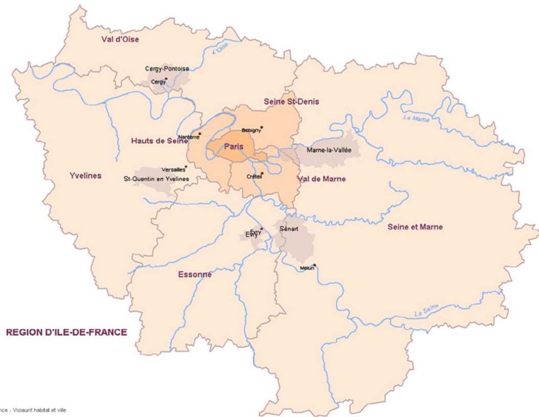
Map 1 Paris and the Ile-de-France Region

Europe, 4 and the innovations related to this new kind of consumption are concentrated in urbanized areas such as Paris. Star’s Services is one of the most innovative French transport firms to appear in recent years. It provides home delivery of grocery products, a market that is considered particularly difficult. The company was created and has seen its growth in the Ile de France Region, which is home to most of its 1,200 vehicles, all of which are refrigerated and have onboard computer systems. The French postal service’s new automated package pick-up network originated in Paris, and most of the expansion has been there. A large number of logistics start-ups, such as La Petite Reine, Urban Cab, and BeCycle (all operating electrically assisted cargo tricycles) or Colizen (specializing in customized home delivery of high value-added on-line purchases with small electric vans) are currently conducting experiments in Paris. Some of them work for major industry leaders such as DHL (La Petite Reine), TNT (Green Logistics) and FedEx (Urban Cab).