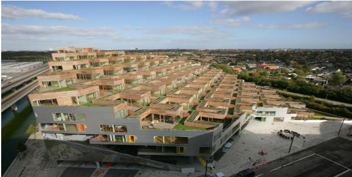
Figure 6. Mountain Dwellings by BIG Architects