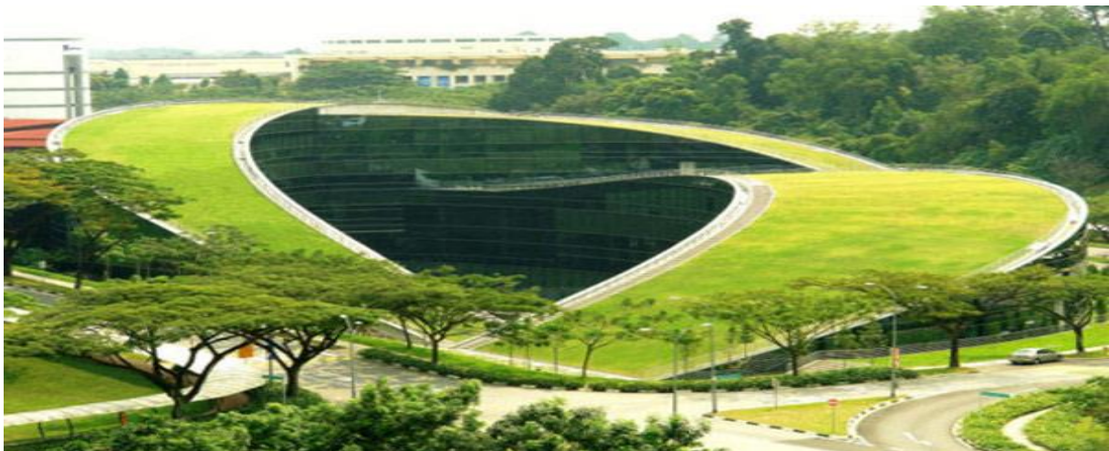
Figure 7. Nanyang School of Art

The Nanyang Technological University of Singapore recently erected a green roof building to house their School of Art, Design and Media. The five story structure features two curved sections with stretches of green roof fully accessible to students. In the Nanyang School of Art, the line between landscape and building are blurred. Beyond the aesthetic value of this green roof design, this living skin saves heating and cooling costs and collects rainwater for landscape irrigation.