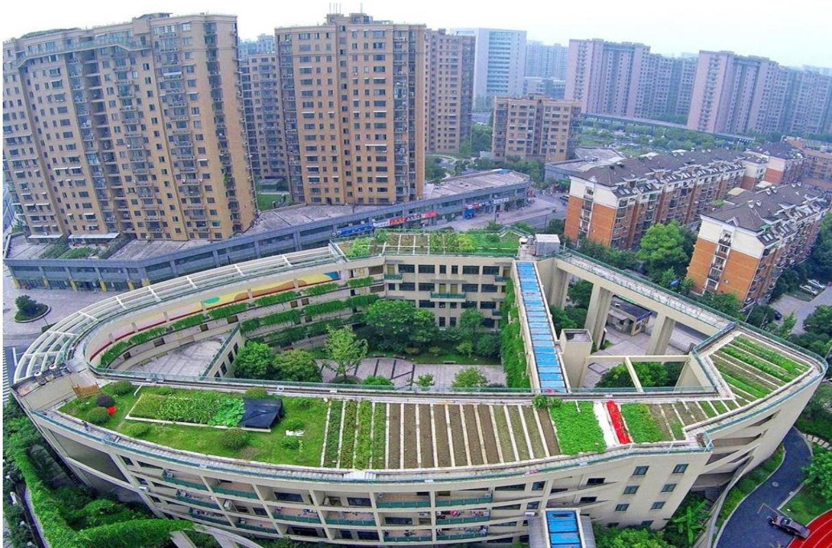
Figure 1. Roof garden in the central city area

In these cases the greenery is sacrificed that is on the Earth land that means the “city lungs” are sacrificed. The expense of the pollution air and unhealthy environment, these two processes are building and implemented, to which, we all agree that they are modern and necessary in the modern society, but not taking the swing completely, that means to be built by the cost of the green area that has existed for a long time.