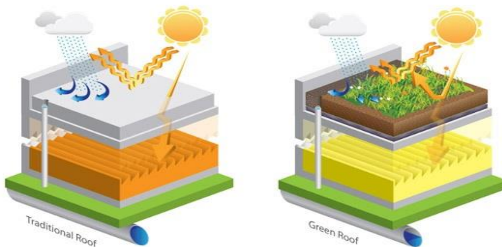
Figure 3. Green roof comparison

One study of the International Canada Council of Research, demonstrated differences, between roofs with and roofs without gardens, in regarding of the temperature. The study shows that the temperature effects on different layers, on every roof in different periods of the day. In that view the roof gardens are obviously very useful, and in the terms of the absorption, power saving, as well as the heat in the certain periods of the day and certain periods of the year.