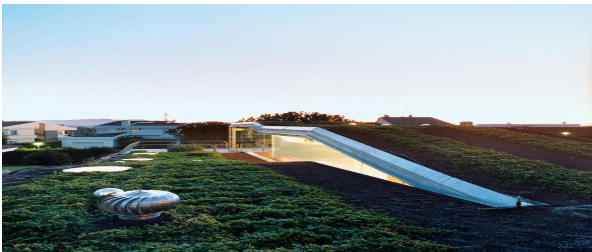
Figure 4. Villa Bio by Enric Ruiz-Geli

The green roof design of Villa Bio stands out amongst a community of cookie-cutter, Mediterranean-style homes in Llers, Spain. While it was first met with controversy, the completed Villa Bio reflects the nature of the local landscape much more intimately than its neighbors. That nature does not end at the corner of its plot, but continues on to the home's hydroponic garden that snakes along its green roof. Architect Enric Ruiz-Geli has masterfully designed a home with a seamless connection with the Mediterranean environment, an organically-inspired structure with a lush, productive green roof.