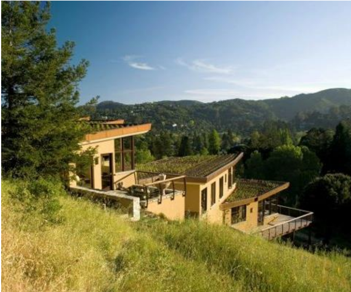
Figure 5. Mill Valley Residence by McGlashan Architecture

This terraced, multi-family home in Mill Valley, California is as hilly and green as the environment around it. The Mill Valley Residence by McGlashan Architecture includes three sections, each with its own green roof, built into the hill of the lot. The green roof design of the Mill Valley Residence may not produce vegetation of the garden variety, but plants that hail from the home's local flora. The result is a stunning home with a green roof that reduces heating and cooling costs and stimulates the habitat of local Mill Valley wildlife.