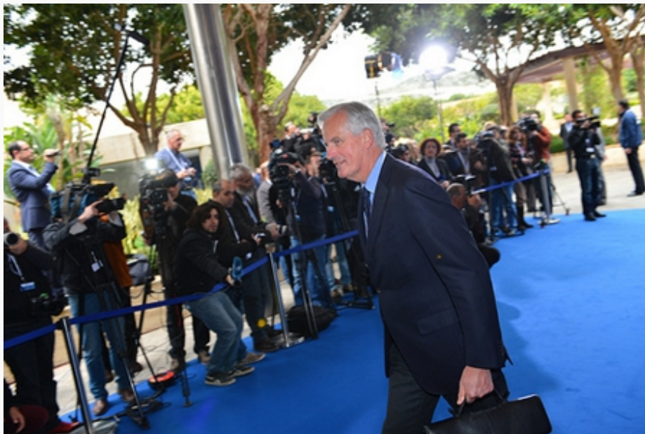
Internal Market Commissioner Michael Barnier

For the third element, the resolution or restructuring of failed banks, Internal Market Commissioner Michel Barnier has made a bold proposal . He wants the European Commission to take on the responsibility to trigger and carry out bank restructurings, and he wants to introduce a European bank resolution fund. Why?