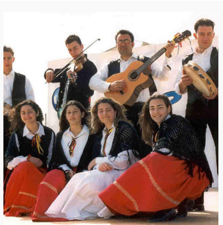
Grecanici cultural group

At the end of the 1960s a strong Grecanici civil society rapidly started taking shape. With the fundamental aim to address the Questione Grecanica (the Grecanici problem), the first Grecanici civic associations debated the local and international import of ‘protecting’ and ‘salvaging’ their Greek language. Their policy advocated new outreach initiatives to engage with as many Grecanici as possible, both in the city of Reggio Calabria and the Grecanici villages, proposing a new ideology regarding Grecanico language, heritage and patrimony. Due to its Ancient Greek roots, the Grecanico language was considered superior and the Grecanici were encouraged by the cultural