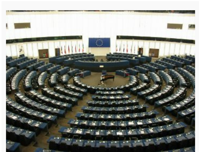
European Parliament.

Will the upcoming elections to the European Parliament change the tide? The parliament that will take office in June 2014 will command more power than any European legislature before it. Besides its significantly expanded competences in legislation, it is entitled to elect the President of the European Commission. Of course, the Commission President is not comparable to a head of state or government of a Member State. He or she does not have the power to determine the political objectives of the EU, let alone the overall course of European integration.