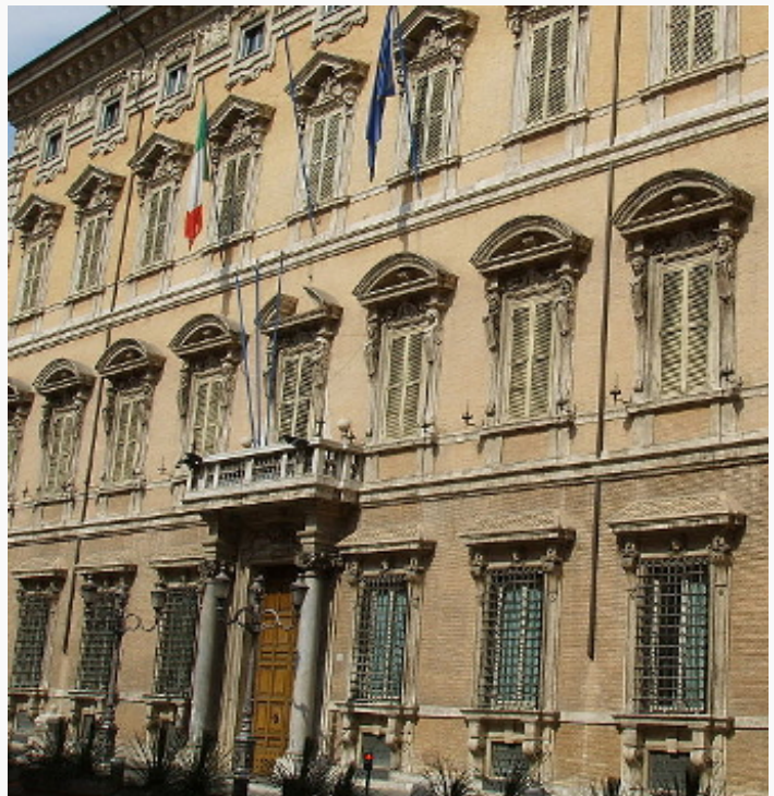
Italian Senate building, Credit: Saiko (CC-BY-SA-3.0)

The Porcellum takes its name from a declaration of the then Minister for Reforms Roberto Calderoli, from the Lega Nord (Northern League), who, despite being its main proponent, declared it 'una porcata', meaning either 'a load of rubbish' or 'a dirty trick' – probably both. As Matteo Garavoglia explained convincingly elsewhere on this blog , the 2005 electoral law was an anomaly in Europe. Indeed in a ruling on 4 December 2013 the Italian Constitutional Court declared the majority prize and the closed lists of the Porcellum unconstitutional. The former gives the winners