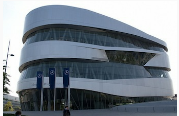
Mercedes Museum in Stuttgart

In addition, Germany has a trade surplus which hit its second highest level in more than 60 years in 2012. In 2013 it ran another surplus: at around 7 per cent of GDP, it is comfortably the largest in the Eurozone. Given that the Deutsche Bundesbank is the biggest among all the national banks to contribute to the ECB, it has the loudest voice in how the bank should run the monetary policy of the Eurozone .