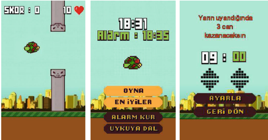
Fig. 1. Example screenshots from ‘ Sleepy Bird ’

The app was designed with a Turkish language interface to fit the target user group of the study. At the top of the game screen, the score and remaining lives were displayed (see Fig. 1). For the gamified version, Sleepy Bird was designed to have four buttons on the main screen, which were grouped into two with color coding. OYNA ( play ) and (EN İYİLER) ( leader board ) buttons were related to gaming; ALARM KUR ( set alarm ) and UYKUYA DAL ( sleep ) buttons were related to sleeping-waking up. For the non-gamified version ‘play’ and ‘leader board’ were removed.