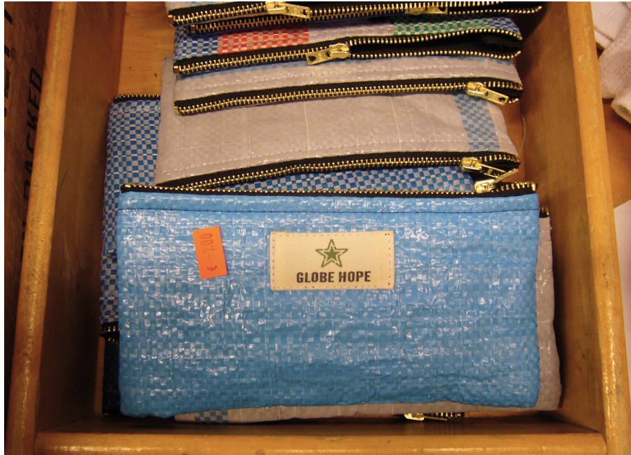
Clutch bags made from recycled banners at Globe Hope headquarters in Nummela, Finland

A new collaborative paradigm can have a game-changing impact on the families of this region. Moreover by producing locally and believing in the domestic system, designers are excited to keep jobs at home and not have them go overseas. They are looking towards preserving traditional manufacturing skills. Another aspect is how CSR practices also center their design process as fair wages and fair compensation where healthy work practices are implemented.