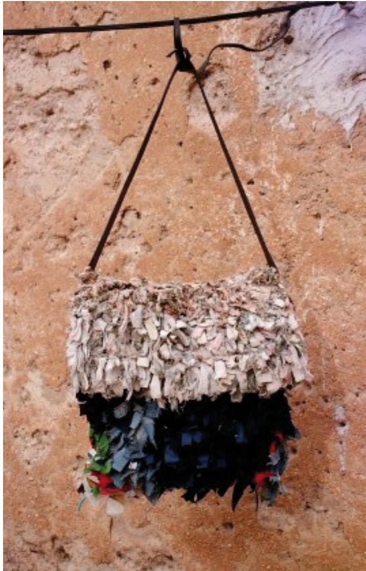
Carolina Obregón design, handbag made from recycled hand woven carpet. Obregón, C., 2003. Fes, Morocco Collection: Tapete . [photograph].