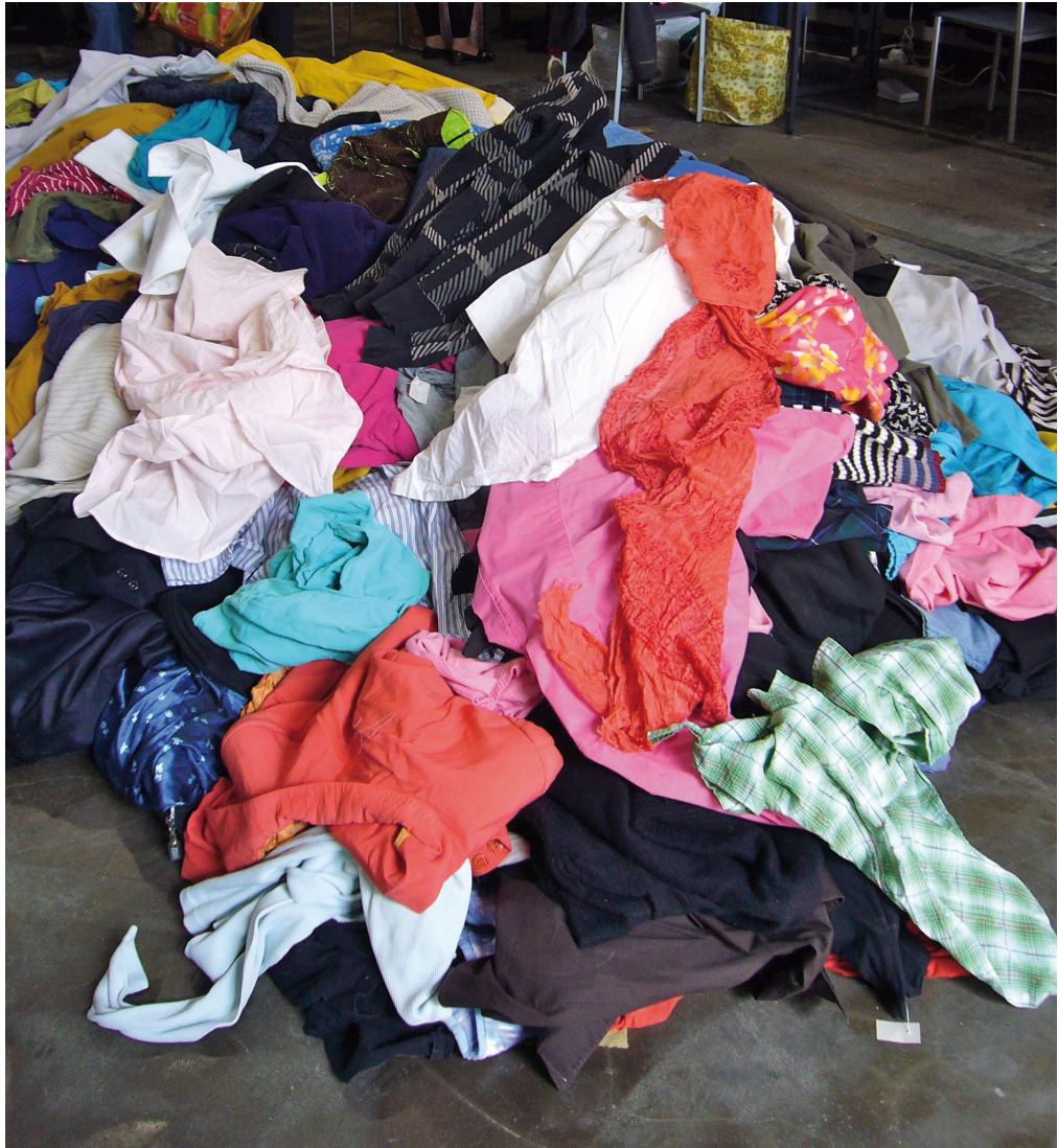
Clothing used for "make your own" workshops at The Recycling Factory in Helsinki, Finland.