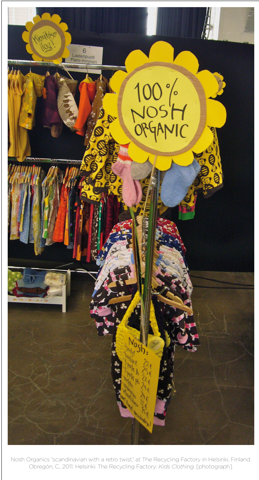
Nosh Organics "scandinavian with a retro twist," at The Recycling Factory in Helsinki, Finland.