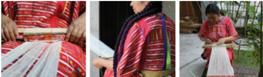
The weaving process represents the cycle of life and death.