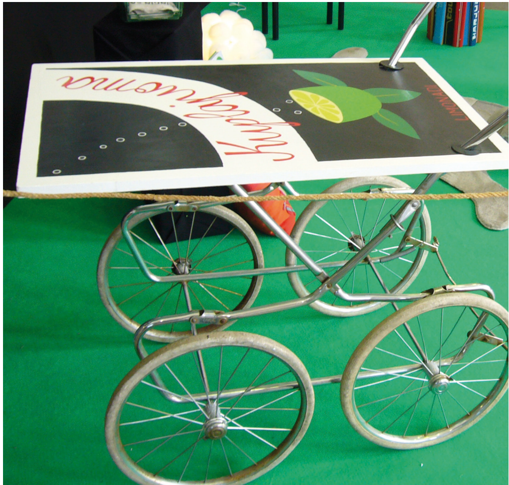
Table made from a recycled poster and baby carriage at The Recycling Factory in Helsinki, Finland.