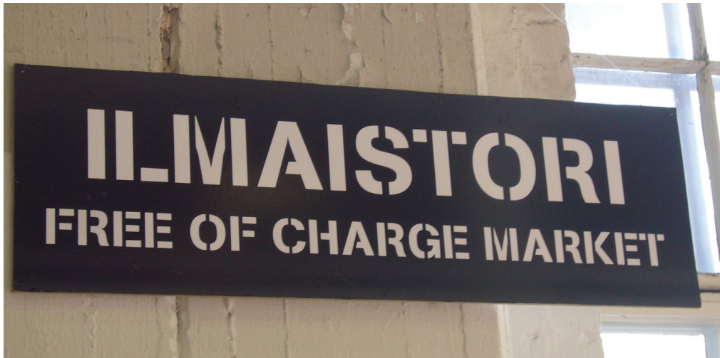
Free market where people swap clothes or home accessories in the Cable Factory. Obregón, C., 2011. Helsinki. The Recycling Factory: Free of Charge . [photograph].

Teach the consumer to buy eco and in twenty to thirty years maybe after that we will see a change of paradigm (Helle, 2011).