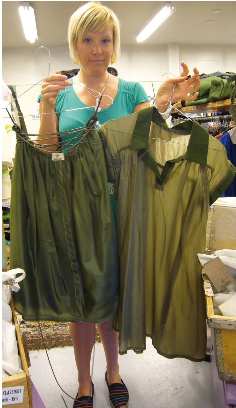
Dresses made from recycled parachutes at Globe Hope headquarters in Nummela, Finland. Obregón, C., 2011. Nummela. Globe Hope Headquarters: Parachute dresses . [photograph].