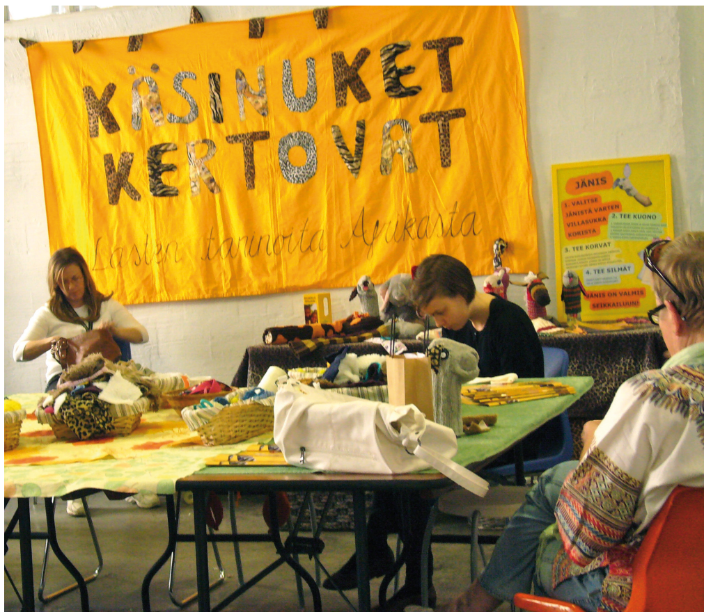
Collaborative workshop participants make their own garments from recycled clothes.