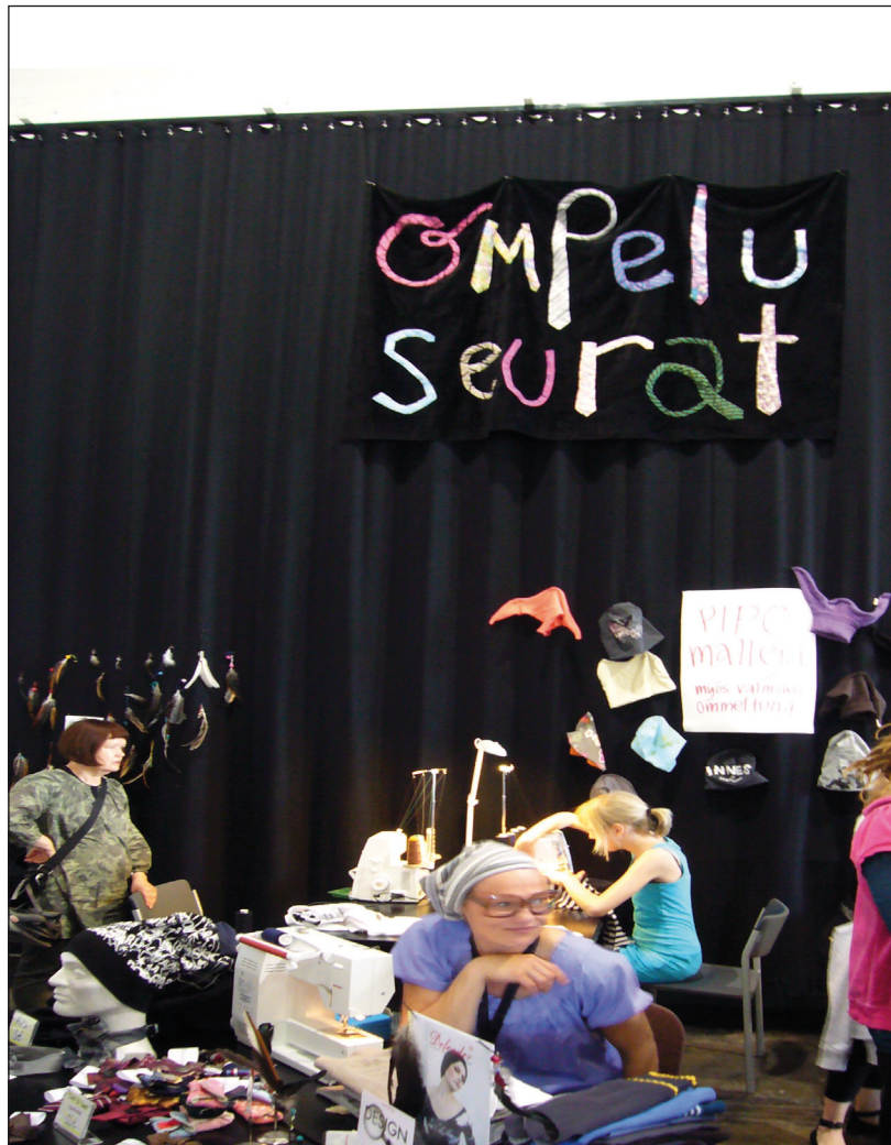
Collaborative sewing clubs at The Recycling Factory participants make their own garments from recycled clothes.

Obregón, C., 2011. Helsinki. The Recycling Factory: Sewing Clubs . [photograph]