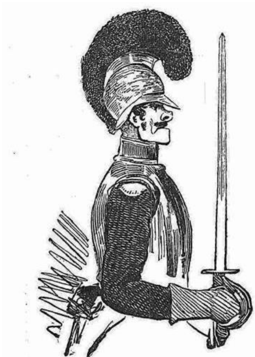
Figure 1 'The Dragoon', Bell's Life in London , 12 April 1835

The Digest of Services of the King's Dragoon Guards records that they were stationed in a variety of locations throughout the region in late-May 1835: