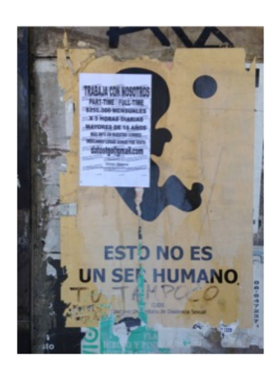
Figure 1: Pro-choice poster, Santiago, Chile.