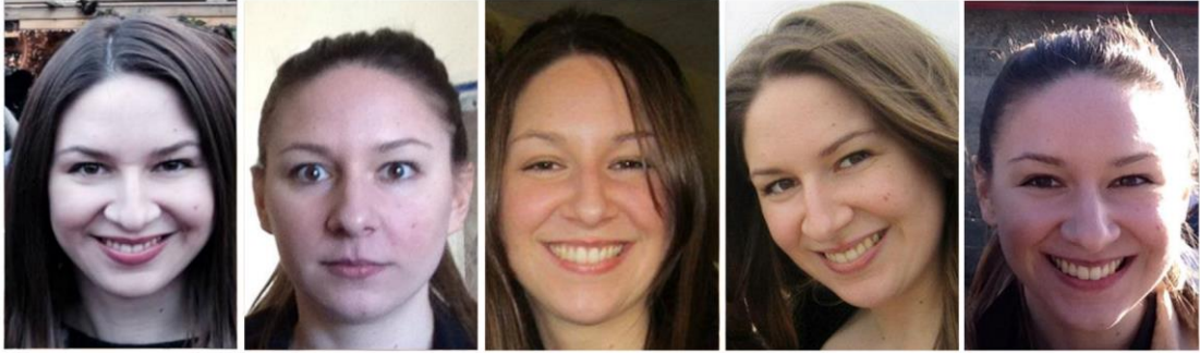
Figure 2. Example stimuli – five images showing the same identity. Stimuli were shown in full colour, and were unconstrained in terms of facial expression, lighting etc. Images in this figure are representative of the experimental stimuli and show an identity not used in the study who has given permission for her images to appear here.