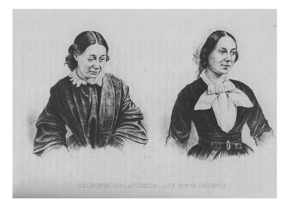
Figure 6. Hugh Welch Diamond, 'Religious Melancholia and Convalescence', from photographs, in Medical Times and Gazette (October 1858), between 368 & 369.

The next sequence of recovery and cure, on Plate 15, showed a woman who had been diagnosed with religious mania (figure 6). While in the throes of madness, her hair was messy and uncovered, and her dress was disordered and lacking accessories. When recovered, this patient was neatly tied, belted, and literally re-covered with a bonnet on her head. Of another recovered patient, Conolly noted that 'subsequent photographs are scarcely to be recognised as being likenesses of the same patient', particularly as 'the hair is well arranged'.<sup>54</sup>