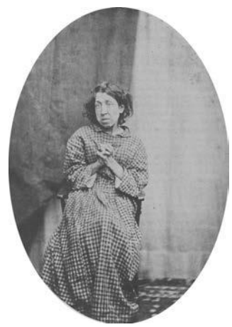
Figure 4. Hugh Welch Diamond, 'Suicidal Melancholy', albumen print from a wet collodion negative, 1852.

In his commentary on the 'suicidal melancholic' depicted in Plates 3 and 4 (figure 4), pictures of a woman who appeared to begging something of the viewer, Conolly noted: