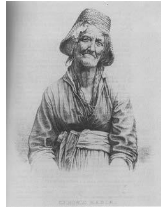
Figure 7. Hugh Welch Diamond, 'Chronic Mania', from a photograph, in Medical Times and Gazette (April 1858), between 404 & 405.

Conolly introduced his discussion to the patient in Plate 11 (figure 7) with comments about her headgear, calling her 'the old lady in the reversed bonnet'.<sup>58</sup> He commented that 'one feels sure that once this poor woman was of a merry mind [...] and turned her bonnet round for very mirth'.<sup>59</sup> Her mental state was visible from 'the strong descending lines from the alae neasi to the depressed corners of the mouth', which spoke to her 'alternations of depression with