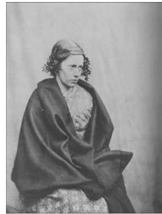
Figure 1. Hugh Welch Diamond, Plate 32, albumen print from a wet collodion negative, 1852. Reproduced by kind permission of the Royal Society of Medicine, London.

The first image I examine is likely the most well-known, both in terms of its content and its iconography (figure 1). In this photograph, the patient is wrapped in a black shawl or mantle, evoking notions of poverty, deprivation, and salvation. Her eyes are focused away from the