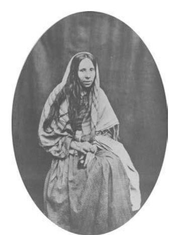
Figure 3. Hugh Welch Diamond Plate 30, albumen print from a wet collodion negative, 1852.

background causes the woman to blend into it; fading away, she and the bird stand on either side of the life/death divide. Unlike the bird, however, she can still be saved. Figure 3 shows a