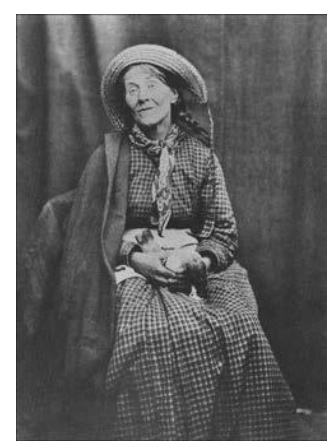
Figure 2. Hugh Welch Diamond, Plate 27, albumen print from a wet collodion negative, 1852.

In Figure 2 the subject clutches a dead bird in her hands. With her head tilted slightly up, she appears deliberately to be looking away from the victim; it is unclear whether she is mourning or celebrating its death, or indeed whether she is at all aware of it. The darkness of the