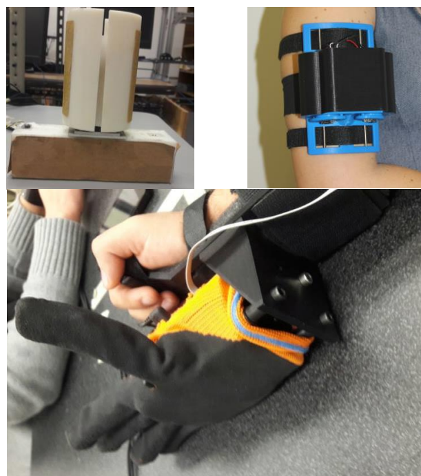
Figure 1. Clockwise from top left: the inverted-T sensorized object, the CUFF, and the SoftHand Pro with the forearm adapter.

One method of delivering sensory information is “modality matching,” or producing a sensation in the user similar to the type of information to be transmitted. We previously explored providing grasp force (pressure) information using a pressure cuff-type device [9]. The device