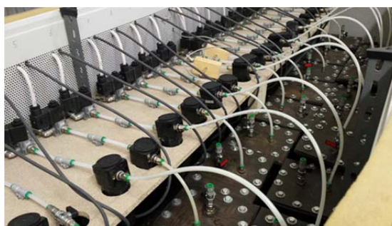
Figure 1: Scheme (left) and photo (right) of the experimental units used for anaerobic digestion tests. Each batch reactor has a gas inlet for flushing at the beginning of the assay (1), a compressed air filter (2), a T-pipe connector (3), a pressure transducer (4) and an opening controlled by an electrovalve (5).