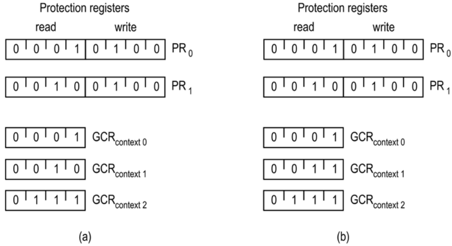
Figure 4. Configuration of the page registers and the global context register for: (a) hierarchical contexts; and (b) protection rings.

context contains the access rights associated with that context, which are not inherited from the child contexts. In the GCR configuration for a given context, we set the bit corresponding to the domain reserved for that context; furthermore, if the context has child contexts, we set the bits that are asserted in the GCR configuration for each of these child contexts.