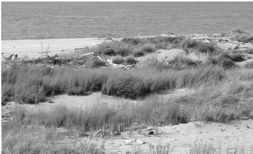
Photo 2: Elymo farcti-Spartinetum Junceum Vagge e Biondi, 1999 (Embryonal dune)

Spartino-Juncetum maritimi O. Bolòs 1962