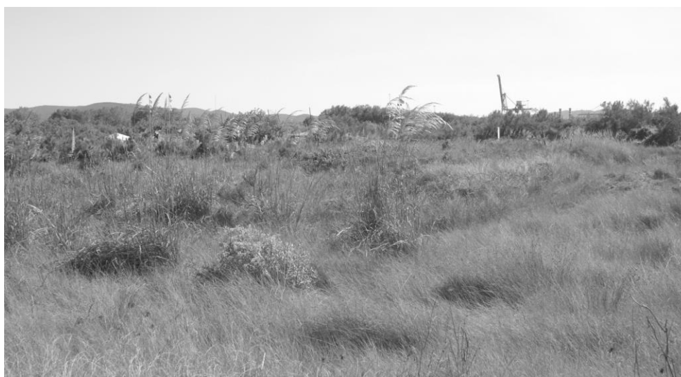
Photo 3: Schoeno nigricantis - Erianthetum ravennae Pignatti 1953 sub-association spartinetosum versicoloris (Interdunal/retrodunal environment)

Places of relevés: Rel. 1, 2, 3, 4 SR – Rel. 5 MV – Rel. 6, 7 TC