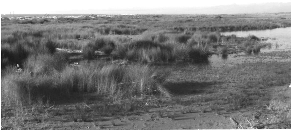
Photo 4: Spartino-Juncetum maritimi O. Bolos 1962 (Wet environment)

As regards the vegetational aspects of S. versicolor populations, a similarity with what is described in European literature is detectable. On the contrary, a comparison, in phytosociological terms, with American communities is rather difficult. In the USA, in environments similar to those along the European and Mediterranean coasts, S. versicolor (cited as Spartina patens ) is often reported in association with several North American species [32, 34, 35], mostly without being treated according to Braun-Blanquet phytosociological methodology and nomenclature. In these contexts the use of phytosociological nomenclature for this species seems to be rare. Among the few examples found in literature we can mention the description, for populations growing on the coasts of Maine, of the association named Spartinetum patentis with three related subassociations, [28].