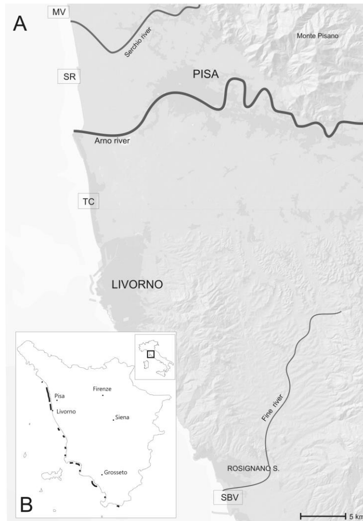
Fig. 1: A-Places of phytosociological relevés; B-Distribution (bold lines) of S. versicolor communities along the Tuscany coasts

On 100 samples, measurements of morphological features (culms per tiller, flowering culms per tiller, flowers per racemes, seeds per flowering racemes) were made to evaluate the fertility rates of the species.