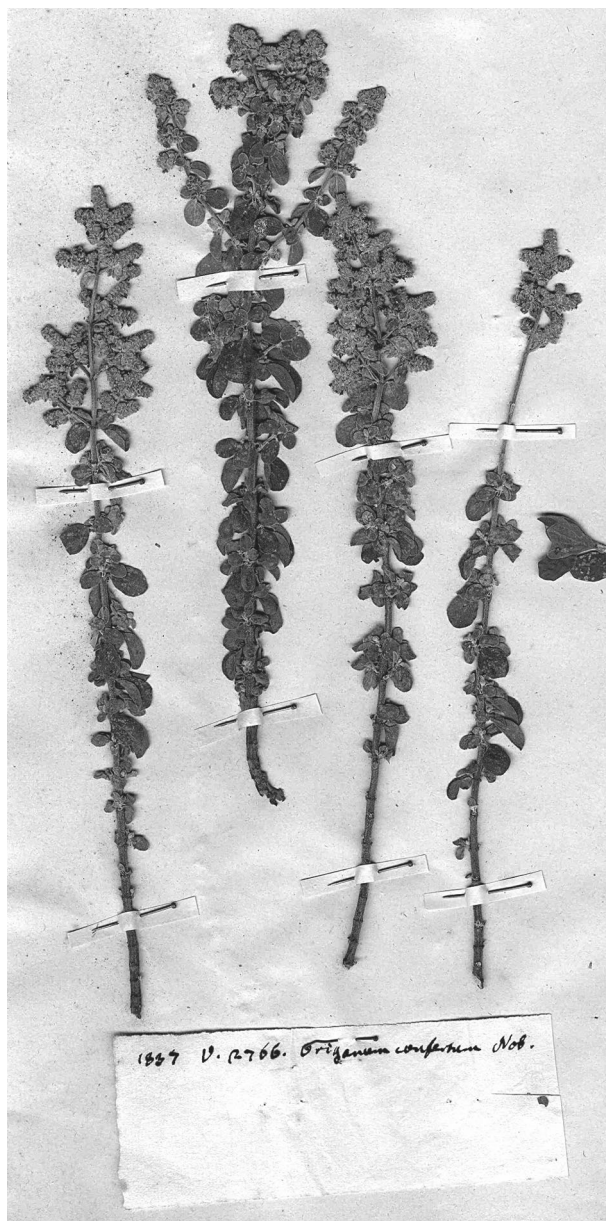
Fig. 1 - Lectotype of O. confertum Savi, kept in PI.

Other herbarium original material: An. 1836 Natu per Origanum aegyptiacum V. 2766. Calix unilabiatus [manu G. Savi], Origanum confertum Nob. [manu P.