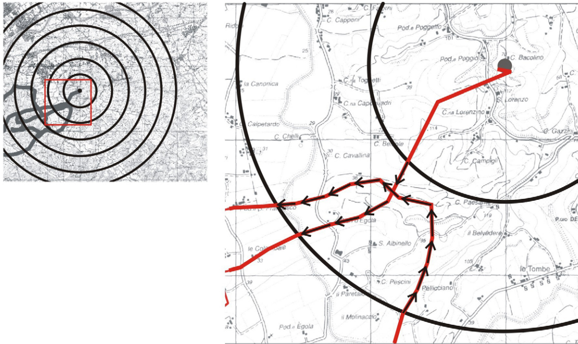
Fig. 1. Example of how a track was divided into portions for the analysis of tortuosity. Each portion included the tracts of the path falling within the ring delimited between two successive circles of 1 km increasing radius (left panel). The analysis was performed from the ring ranging from 1 to 2 km up to the ring ranging from 29 to 30 km. In the right panel, a section of the track falling within the first ring is represented. The arrows represent the directions taken by the bird flying from one fix to the next, which have been used to calculate a mean vector.

Virtual vanishing bearings and virtual vanishing and homing times. We recorded the direction of the birds at both 1 and 2 km from the release site, the latter corresponding to the virtual vanishing bearing. The circular distributions were tested for randomness by means of both the Rayleigh and V-tests and compared using the Mardia–Watson–Wheeler test (Batschelet, 1981). In addition, we compared the virtual vanishing times (the time taken by the bird to fly 2 km away from the release site) and the homing times of the three experimental groups using the Kruskal–Wallis test.