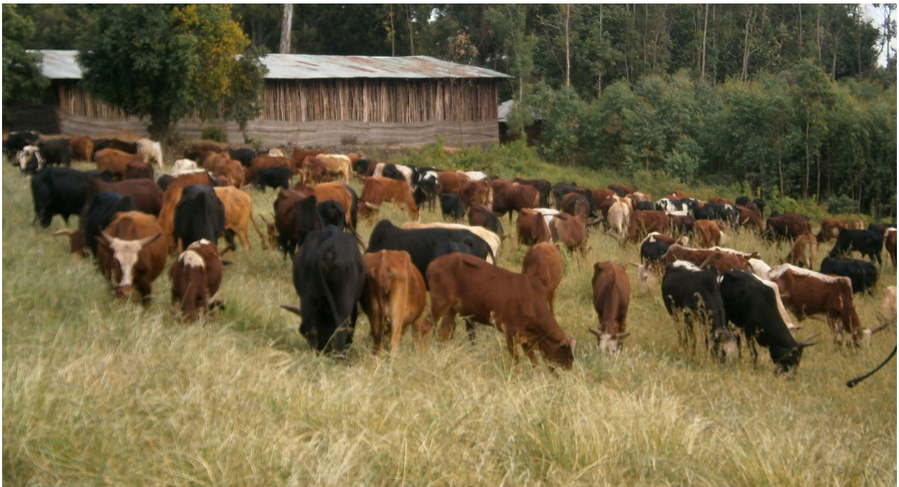
Fig. 3 Cattle grazing on the communal pasture in Kuwalla. Only a relatively small paddock is opened for grazing each day to ensure that the available grass is well used and to avoid trampling of grass, which would waste feed resources. The communal pasture is only for grazing cattle, as sheep and other farm animals are excluded. While this protects the pasture from overstocking, it also excludes poor households, i.e., those not owning any cattle