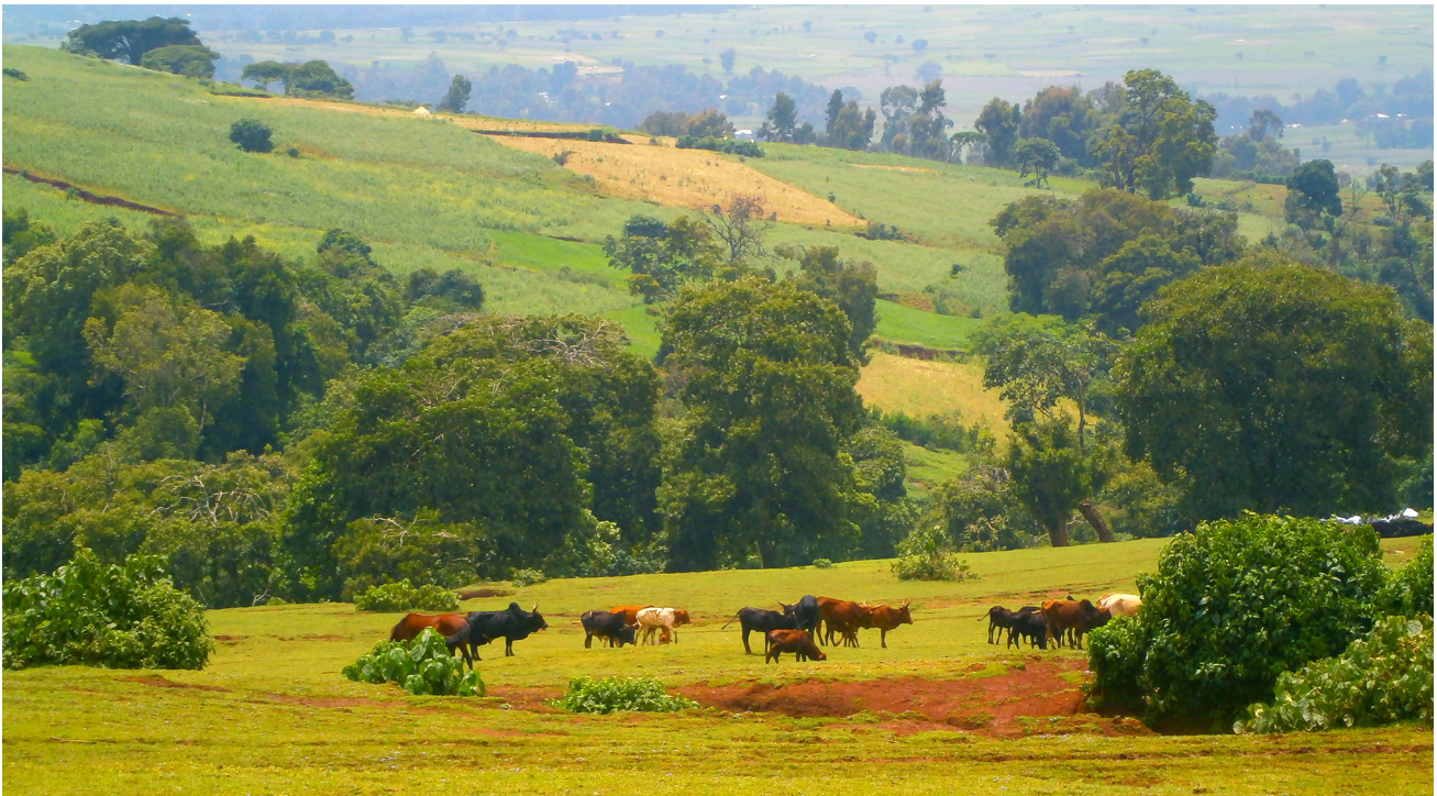
Fig. 2 Typical landscape in Burie district during the rainy season. Cattle is grazing on a pasture and the risk of soil erosion due to overgrazing can be seen in the areas with bare soil. Land use is dominated by subsistence farming. Due to population growth, there is an increasing pressure to convert pastures into crop land, which increases the pressure on the remaining pastures. Indeed, in this mixed-crop livestock system, cattle plays an important role as oxen are needed to plough the fields