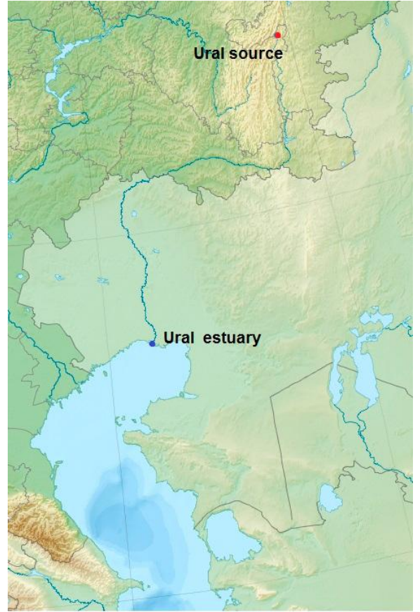
Fig.2. Map of the Ural River with source and estuary