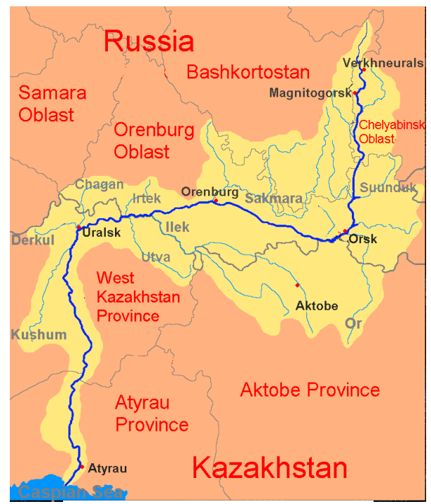
Fig.1. Map of the Ural River basin

VII International Scientific Practical Conference "Innovative Technologies in Engineering"IOP PublishingIOP Conf. Series: Materials Science and Engineering 142 (2016) 012117doi:10.1088/1757-899X/142/1/012117