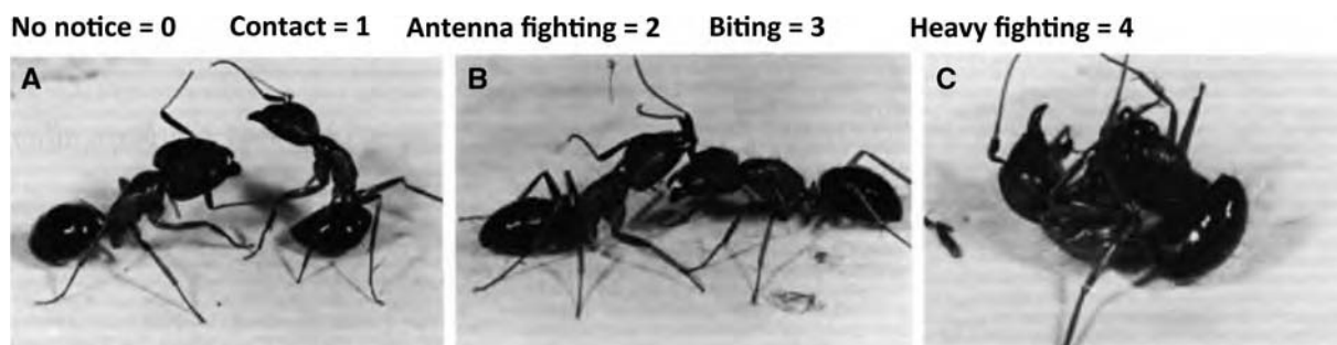
Figure 1. Representative images of aggressive ant behavior, including (A) antenna fighting, (B) biting, and (C) heavy fighting. “No notice” and “Contact” can include ants remaining on the opposite side of the dish, or ants in contact with each other but non-intrusively (not shown).

Whether in wolves, bees, humans, or ants, when uninvited strangers from the same or different species enter the home turf of the organism, the resident often responds with some form of aggression to protect food, space, or offspring. In their science notebooks, students can contrast (1) how they would feel if a stranger entered their house uninvited and approached them and (2) how they would feel if a stranger came within a few feet of them when they were in a communal setting, like a mall or grocery store. Then ask students if they think animals like ants will react in a similar way. How will ant reactions be different? You will likely find that students' predictions about how a group of ants will treat ants from different colonies include some aspect of aggression. This is a perfect opportunity to guide student discussions toward the idea of how to measure the different kinds of behaviors the ants will likely show. Pictorial guides of common ant behaviors can be useful in helping students objectively score the behavior of ants (Figure 1).