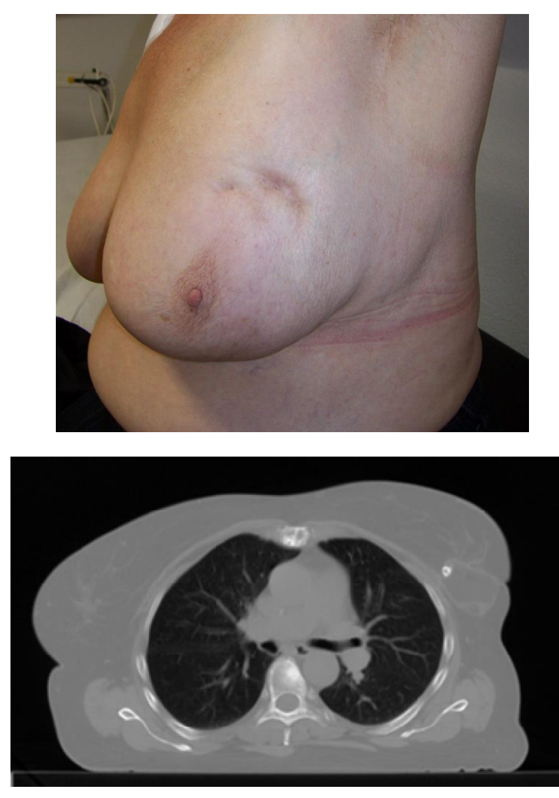
Outcome three years after breast conserving surgery and IORT. Imaging changes like calcifications are typically more pronounced after APBI as compared to standard whole breast radiotherapy without compromising cosmesis.