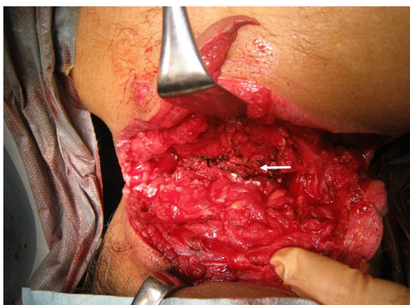
Fig. 3 Operative findings. The nuchal, interspinous, and flavum ligaments between the fourth and fifth cervical vertebrae were ruptured. Major cerebrospinal fluid leakage and vertebral artery injury were absent. The white arrow indicates the perforated flavum ligament

intact and had no neck deformity, including kyphosis or torticollis.