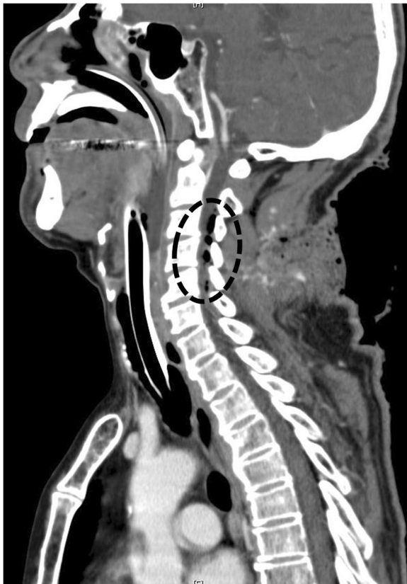
Fig. 2 Computed tomography scan showing air in the spinal canal. The black circle indicates air in the spinal canal, suggesting dura mater perforation