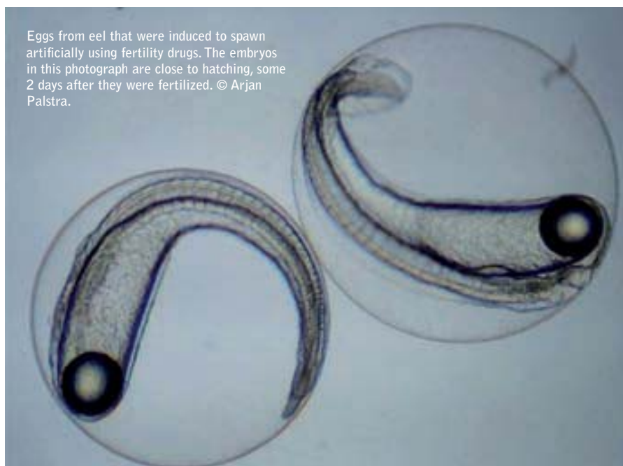
Eggs from eel that were induced to spawn artificially using fertility drugs. The embryos in this photograph are close to hatching, some 2 days after they were fertilized.

At a larger scale, the complex life cycle of the eel, with its long-distance migration to remote spawning areas, may well be affected (if not already) by climate change and shifts in oceanic currents. Such shifts could have dramatic effects on the ability of eels to make their way back to their