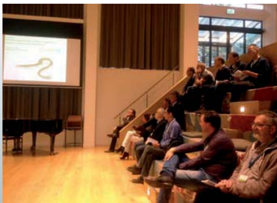
Presentations on eel reproduction at the Impulse Speakers Corner – a neat, open space whose ambiance is to help generate ideas. Wageningen University & Research.

A group of scientists in The Netherlands opted to get researchers, who run such 'eel fertility clinics', together from all over the world. The goal was ideally for each of them to present their state-of-the-art, and then work towards some sort of consortium, where the scientists could