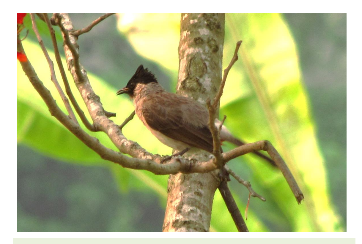
Fig. 3. Sooty-headed Bulbul ( Pycnonotus aurigaster ) at Xishuangbanna Tropical Botanical Garden (XTBG), Yunnan, China; photo credit: Rachakonda Sreekar.