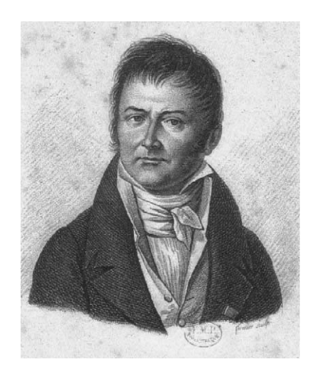
Figure 4 François-Joseph-Victor Broussais (1772–1838).

Broussais has been referred to as 'the most sanguinary physician in history' (Fig. 4). He proposed that all diseases resulted from an excess build up of blood and alleviation of this condition required heavy leeching and starvation. French physicians would commonly prescribe leeches to be applied to newly hospitalised patients even before seeing them. Leeches became the therapeutic agent par excellence, and even inspired fashion. Females wore imitation leech decorations; 'fastidious ladies ... used to deck their dresses with embroidered leeches' and their cosmetic uses included enhancement of their pale complexions.