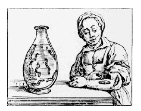
Figure 2 Bossche, Willem van den. Historia Medica (Bruxellae, 1639).

far less painful than the wound inflicted by the other two methods. The fleam consisted of a blade cocked by a spring mechanism, and was also known as a spring lancet. The scarifier was used to make several cuts in the skin at one time, and a bleeding cup was placed over the abrasions. In general, leeches were considered to be of greater benefit when blood had to be removed from a part of the body where a lancet or cup could not be used, such as 'haemorrhoidal tumours, prolapsed rectum and inflamed vulva ... watching that they did not creep out of reach within any of the internal cavities, as serious results might ensue'.<sup>27</sup>