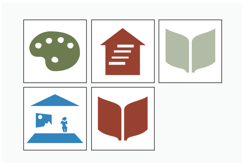
Figure 1. Maki and Custom Icons

With the geolocation data in place and testing successful in the field, we added a Geo Layer prompt to the Creator Pages for direct scanning as well. In final testing, we unfortunately found that cell reception in the building was generally not