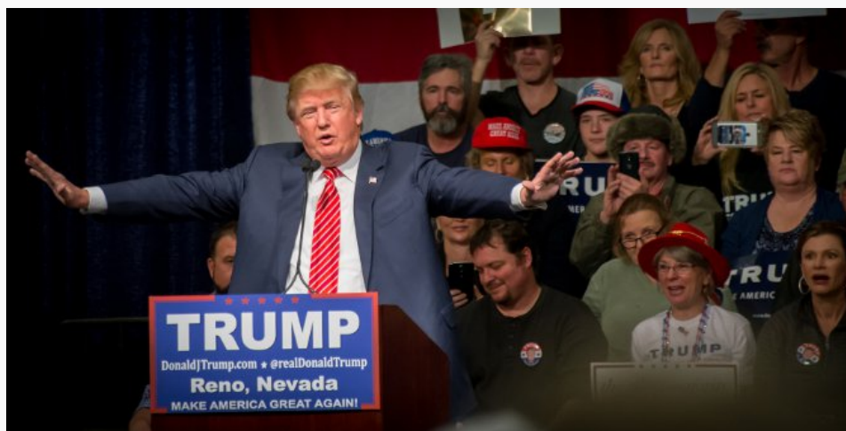
Donald Trump