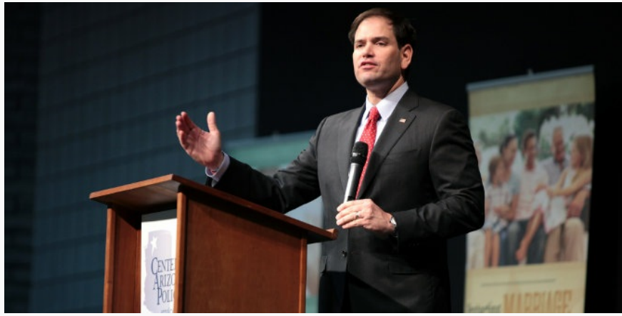
Florida Senator Marco Rubio