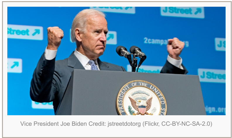
Vice President Joe Biden