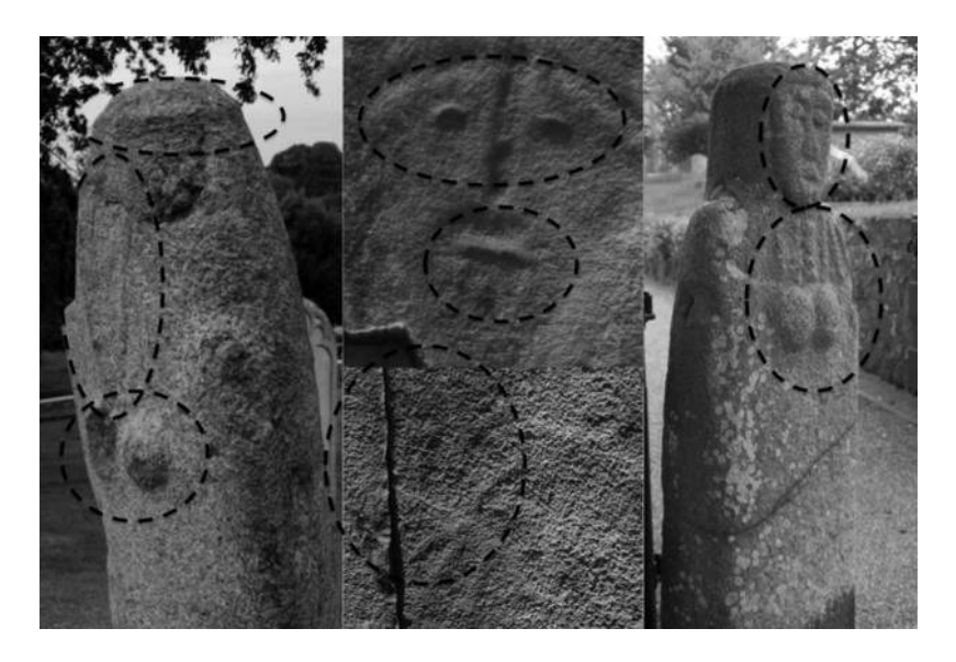
Figure 4. Examples of dressing and pecking techniques used to create anthropomorphic attributes. Left to right: Câtel statue-menhir, Déhus figure, St. Martin's statue-menhir.

scenes, but the use of paint is not precluded. Colour is an important aspect to consider, either as added during production or in terms of the stone itself. While there is no indication of painting on the surface of the images, feldspar, part of the island's mineralogy, may have given some freshly dressed stone a slightly pink colouration. However, increasing re-evaluation of megalithic art in Iberia and France indicates that painting was more commonly used alongside engraving and pecking techniques than previously thought (e.g. recent work at Barnenez: Bueno Ramírez et al., 2012). Producing bodies in particular media in combination with particular technologies, such as primarily pecking and grinding, meant detail was shallowly ascribed on the body and the imagery produced was static in its presentation of the ideal social body or body aesthetic.