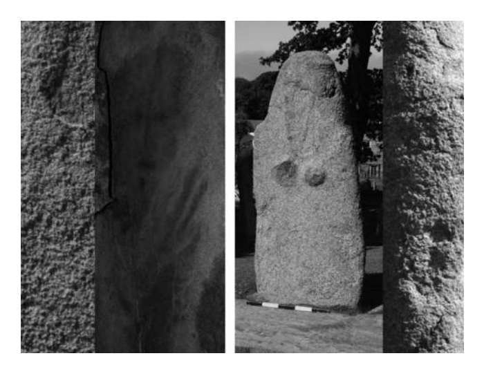
Figure 3. Close-up of stone surfaces. Left—the Gardien du Tombeau; right—the Câtel statue-menhir.

many potential features of material. In most examples, however, different qualities of stone have been discussed for megalithic constructions or rock art rather than as stone used to represent the body.