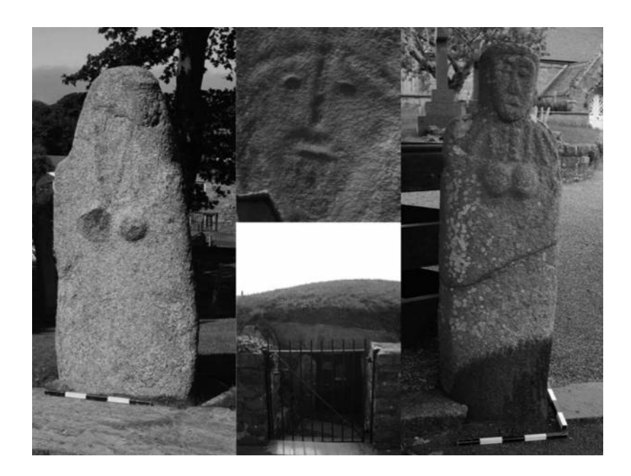
Figure 2. The three bodily images discussed in the text. From left to right: the statue-menhir at Câtel Church, the Déhus chambered tomb and gardien, and the statue-menhir at St. Martin's Church.