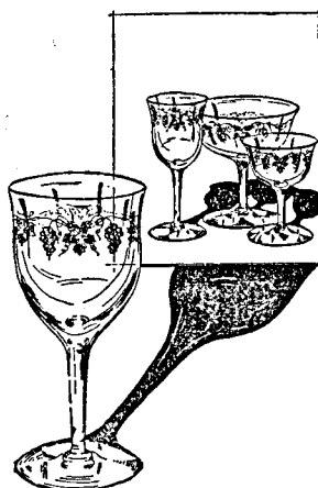
The Vintage Pattern

Dear to the heart of every woman are her jewels. She takes pride also in the possession of at least a few jewels of the well-dressed table—it's Glassware. Because of the acceptability of glassware as gifts, she will be interested to know that Dimond & Company displays the most comprehensive collection of the finer glassware in Honolulu. It comprises excellent pieces of pressed, blown and cut glass from such famous makers as: Paden City Glass, Luzerne Cut Glass, Heisey Glass, Fenton Art Glass, Murano Italian Glass.