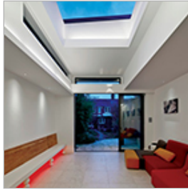
Owlstone Road, Cambridge