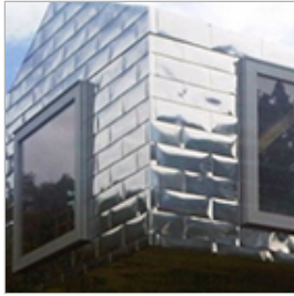
Balancing Barn, Suffolk