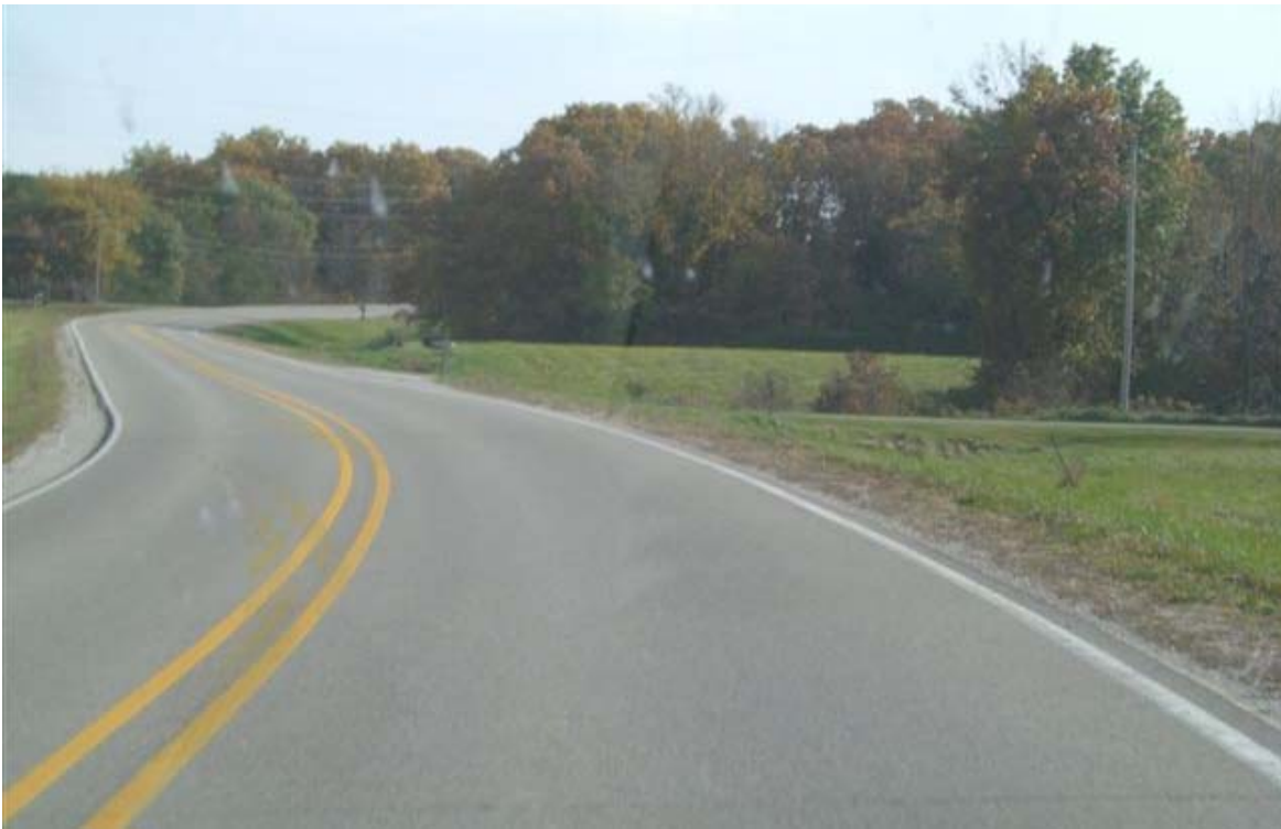
Figure A.4. County Road X-23, reverse curvature alignment