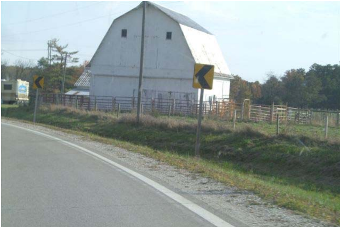
Figure A.6. County Road X-23, closer view of chevrons