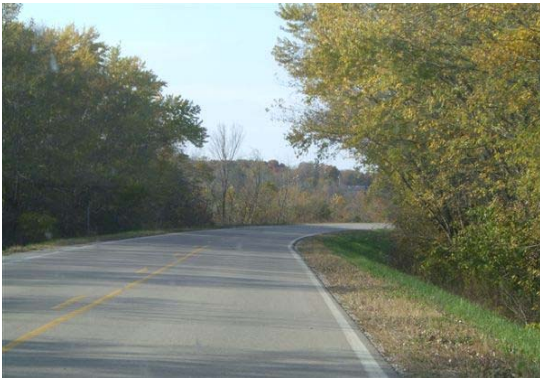
Figure A.10. County Road W-62, close proximity of vegetation along horizontal curve