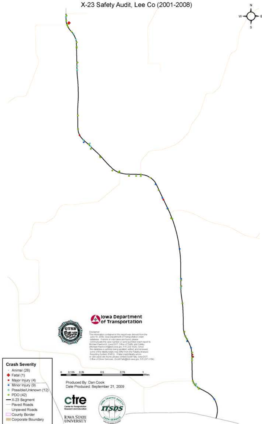
Figure B.1. X-23 crash map for 2001 to 2008