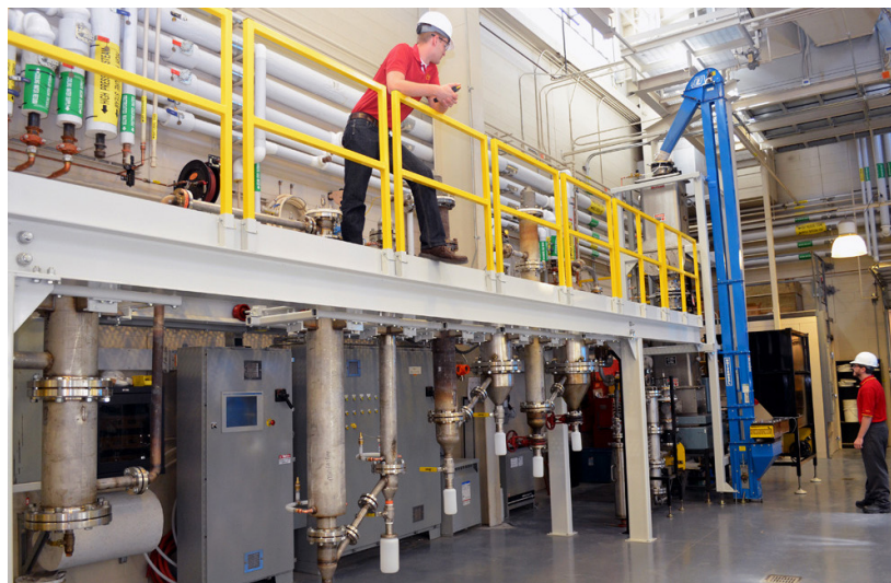
Iowa State University biofuels fast pyrolysis pilot plant

While the rheological properties of neat bio-binders differed from those of conventional asphalt binders, polymer modification of the bio-binders significantly changed their rheological properties and made their rheological behavior similar to that of conventional asphalt binders. Good high-temperature performance grades were obtained for the bio-binders, which performed similarly to conventional binders. However, low-temperature performance grades varied greatly from those of conventional binders.