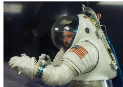
Form, Fit, and Function Testing of EVA Swab With Mark III Suited Subject

NASA has a strategic knowledge gap (B5-3) regarding what life signatures leak/vent from our Extravehicular Activity (EVA) systems; this potentially impacts how we will search for evidence of life at exploration destinations. Funding will be used to fabricate and sterilize test consumables (swab tips), prepare Test Readiness Review products (such as materials compatibility and hazard assessments), certify the EVA Swab Tool, participate in test opportunities as they arise, and perform analysis on collected swabs.