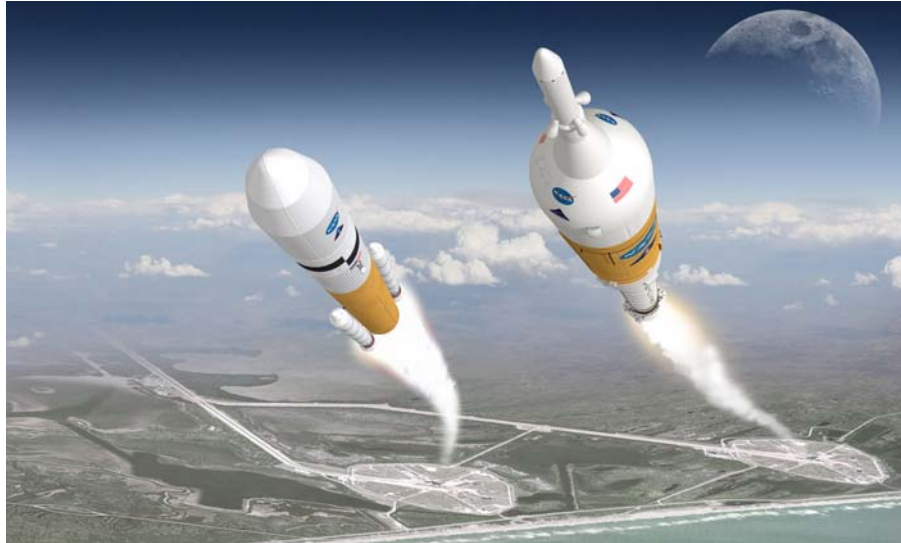
Figure 1. Ares V cargo launch vehicle (left) and Ares I crew launch vehicle (right). (NASA artist's concept)