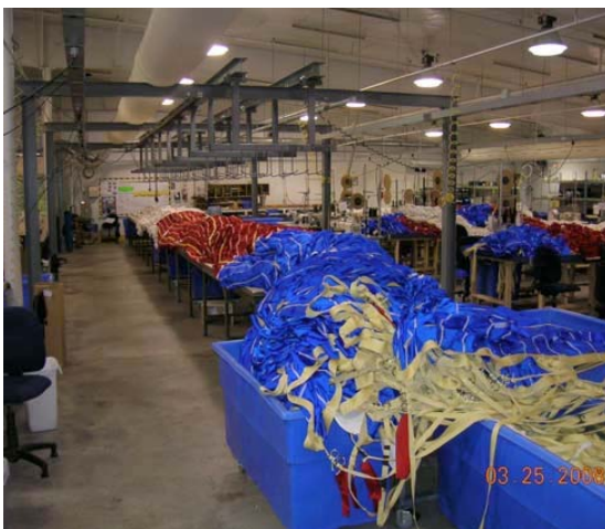
Figure 7. Completed parachute in Mississippi facility.

small increase was made to the previous reefing percentages. Preparations are under way for drogue chute drop testing. (Figure 7)