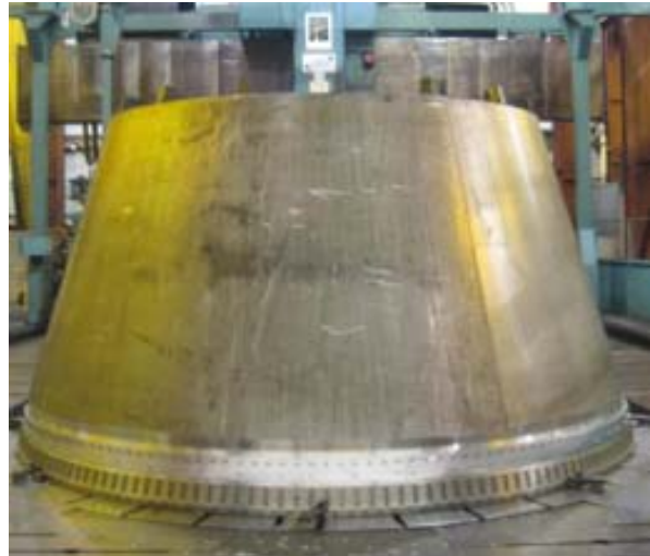
Figure 5. Ares I-X frustum.

The physical transition between the smaller diameter first stage to the larger diameter upper stage is accomplished through the use of a frustum. Although performance and weight are obvious considerations, the frustum is designed for strength. Although the frustum for the Ares I-X will be metal (Figure 5), to prevent buckling and develop robustness in the design, the frustum for the Ares I will be composed of composite materials. The use of composites facilitated a change in the geometry, which in turn afforded the ability to focus strength where it is needed, without additional mass. Shortly after separation, booster tumble motors located on the frustum ignite to start the first stage tumbling. The frustum-interstage assembly is jettisoned in a secondary separation at a separation plane located near the aft end of the frustum. As the first stage begins to tumble, the centrifugal force will be sufficient to propel the frustum-interstage assembly away from the first stage without re-contact. Several notable achievements have been accomplished to date. Composite panels have been manufactured with a fiber placement process and design allowable values are being characterized for the various lay-ups. The frustum end ring has already been manufactured and will be utilized in upcoming separation tests.