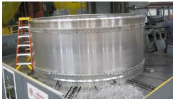
Figure 6. Forward skirt extension.