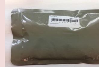
Retort Thermostabilized or Irradiated