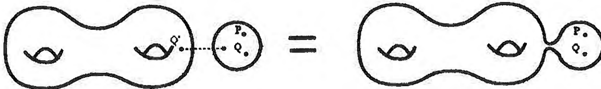
Fig. 1: Sewing to get two colliding points.

punctures on \Sigma , the local coordinates at those punctures are also chosen to be independent of q . The only dependence on q is in the plumbing fixture.